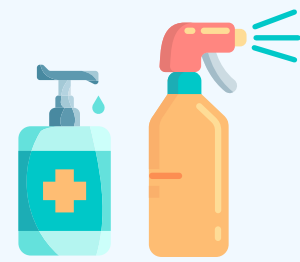
CLEAN OFFICES Our staff is disinfecting all surfaces multiple times a day and after every appointment.